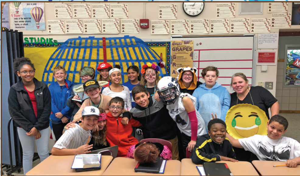
Liquori's class displayed their DNA around the classroom