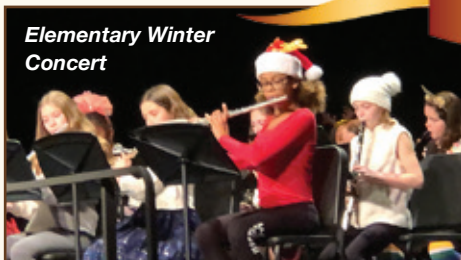
Elementary Winter Concert